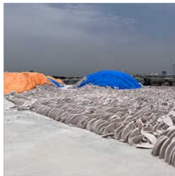
PURE CHINA CLAY

Calcin kaolin, China Clay, Natural Silica Sand, Pure China Clay, etc.