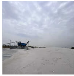
Natural Silica Sand